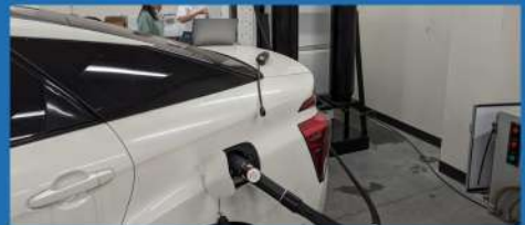
CHRS refueling a FCEV