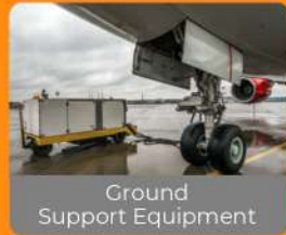
Ground Support Equipment