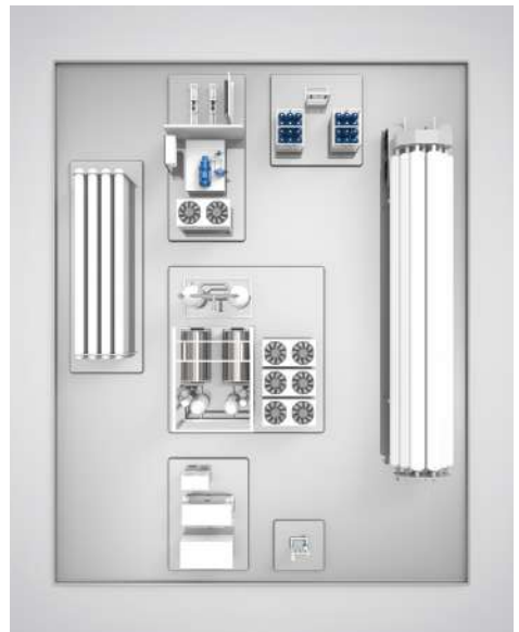
Aerial view render of SHEP's components.